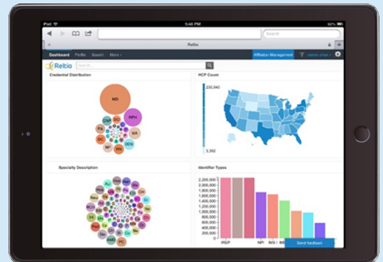
Figure 2 – Reltio IQ

Finally, we should comment that the Reltio platform includes significant collaborative and